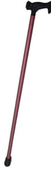
Classic Walking Stick

Available in Natural and Various colours