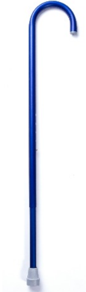
Cane Walking Stick

Available in Natural and Various colours