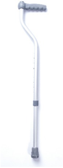
Adjustable Aluminium Walking Stick S-Bend

Available in Natural and Various colours