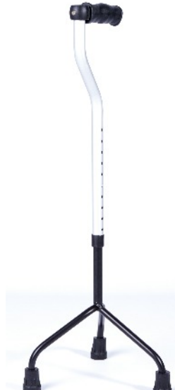
Tripod Walking Stick