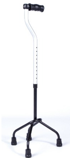
Quadruped Walking Stick